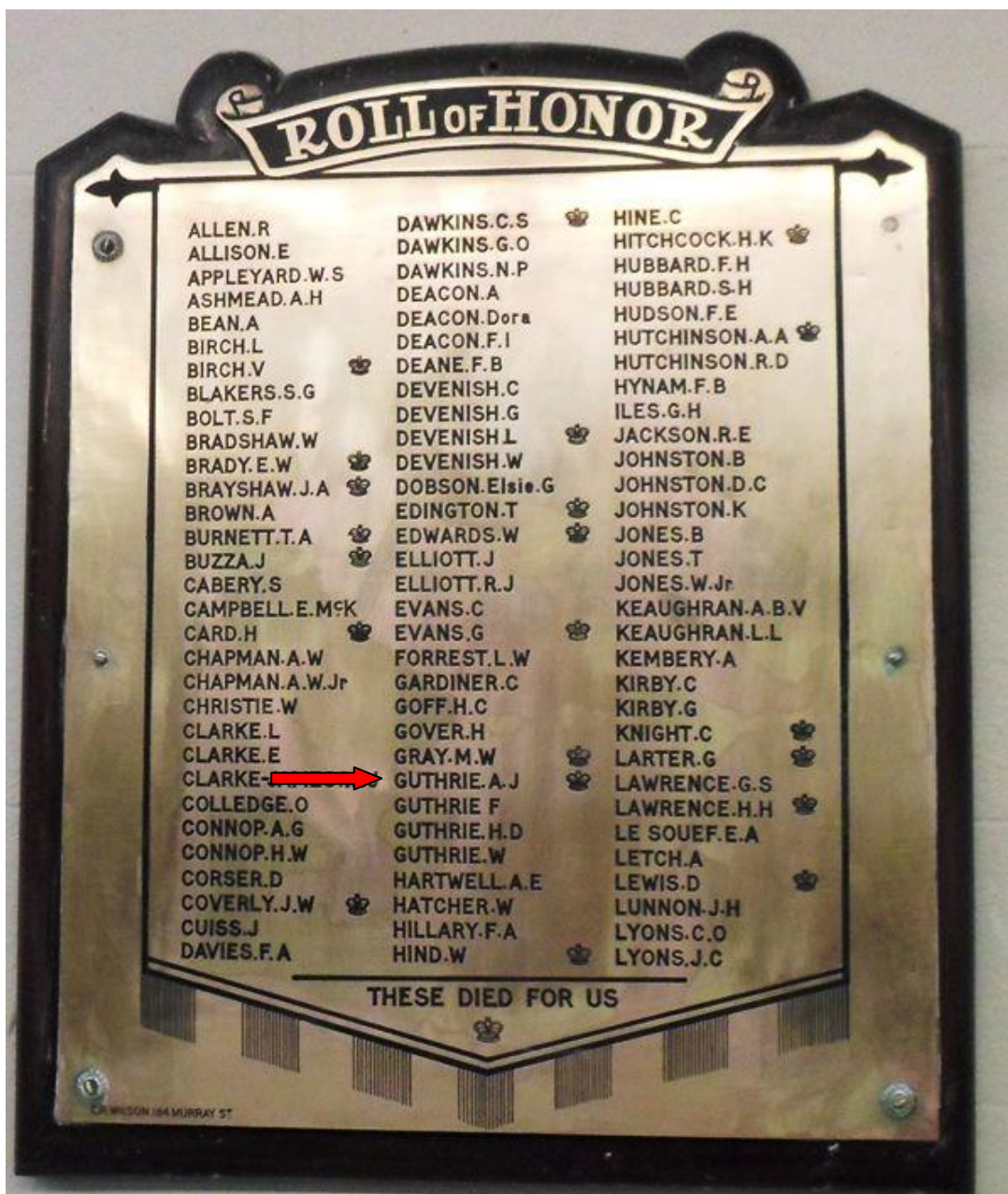
Trinity Church Roll of Honour