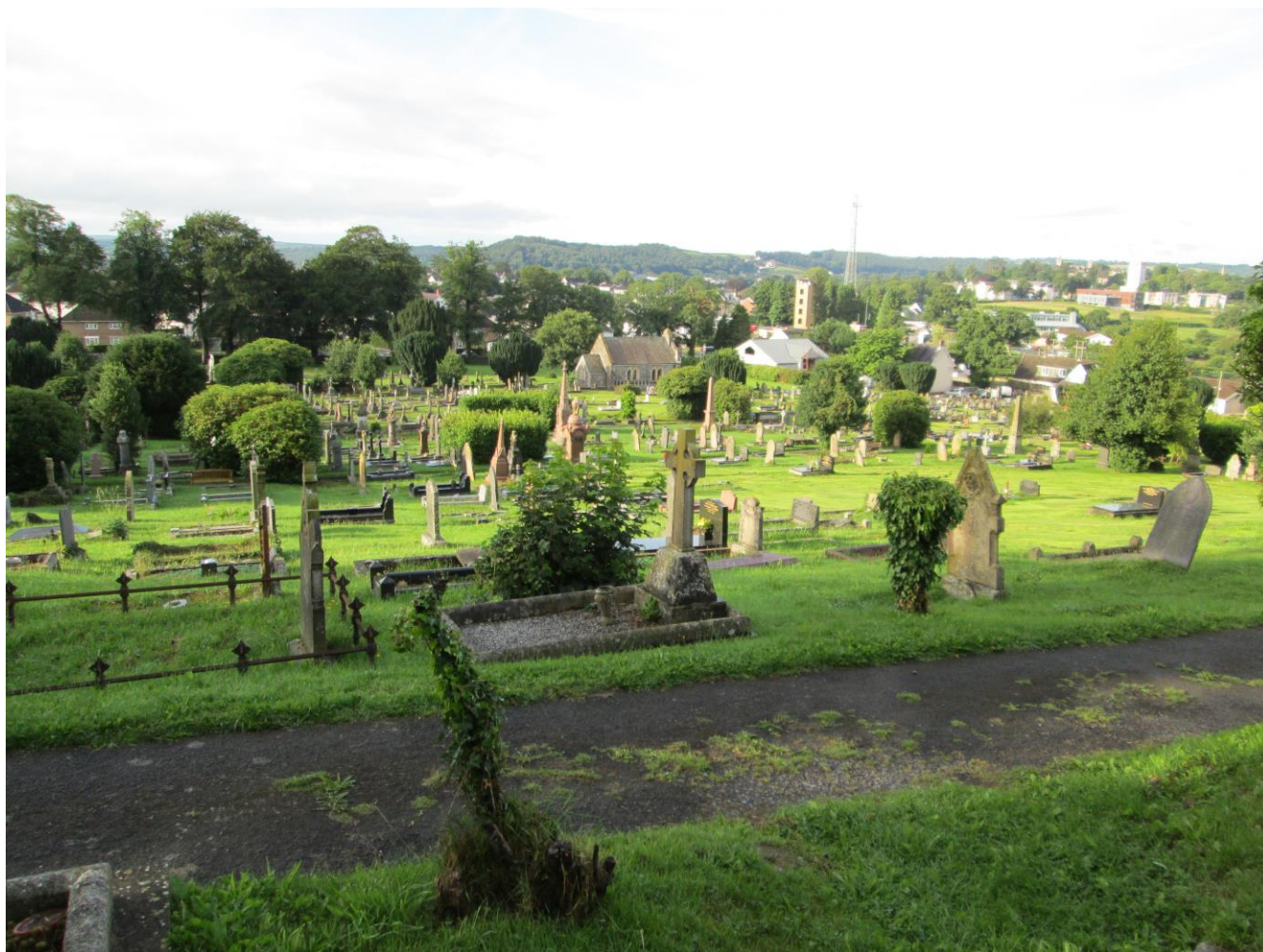
Carmarthen Cemetery, Wales

Carmarthen Cemetery contains 18 Commonwealth War Graves – 9 from World War 1 & 9 from World War 2.